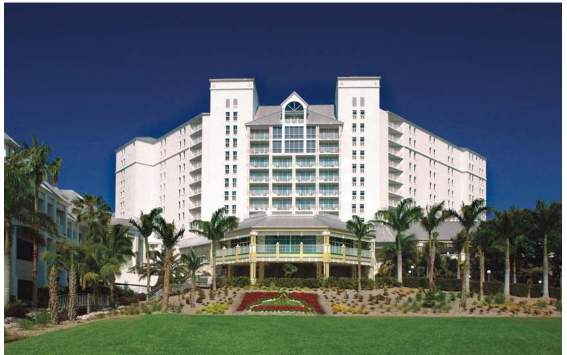
Sanibel Harbour Resort & Spa Fort Myers, Florida