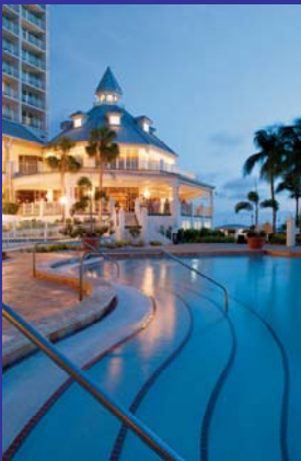
Charleys Restaurant at Twilight