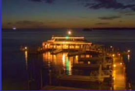
Sunset – Boat and docks