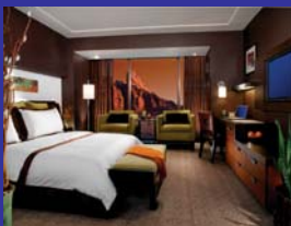
King hotel room

The Executive Committee met on November 28, 2006 during the RSNA meeting in Chicago, IL. The following are highlights of the meeting.