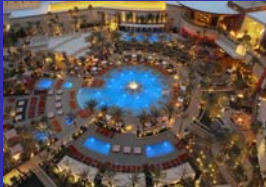
Backyard of Red Rock Casino, Resort & Spa