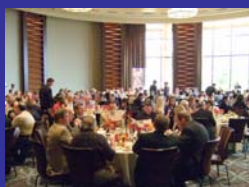
Members Business Meeting