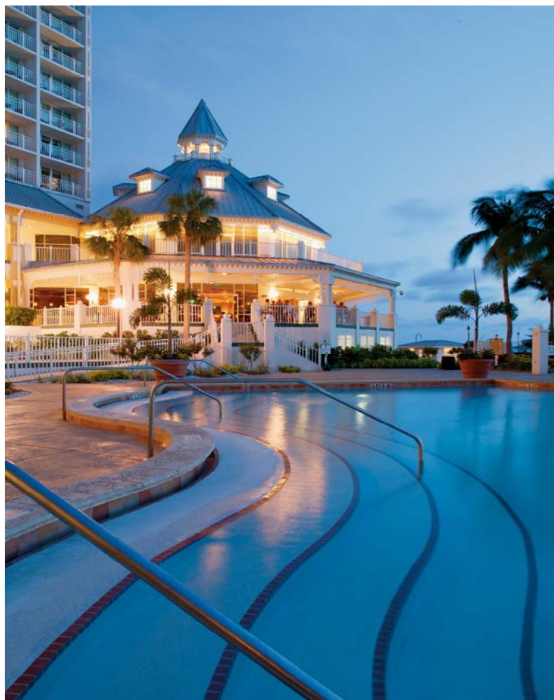
Sanibel Harbour Resort & Spa Fort Myers, Florida