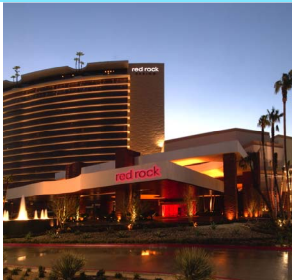
Red Rock Resort, Casino & Spa Las Vegas, Nevada