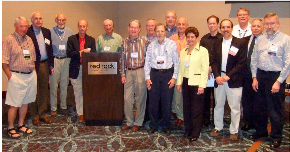
Founding members at luncheon